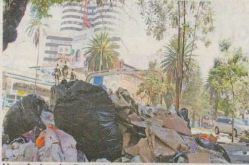
A heap of garbage along Kenyatta Avenue in Nairobi's Central Business District.

"Profit has replaced professionalism in too many cases. The Architectural Association of Kenya must aggressively hold accountable those members who